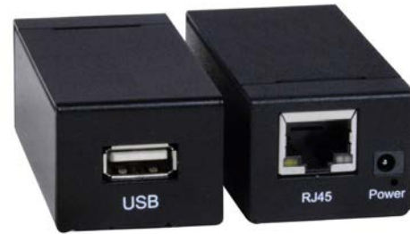
XTENDEX® USB2-C5-LCND492 (Remote & Local Unit)