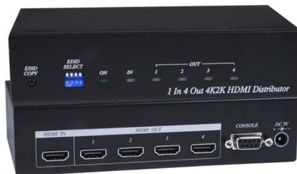
VOPEX-4K18GB-4 (Front & Back)